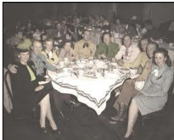
The Awards Banquet's always an occasion.

Be sure you and your musicians have these key spring events on your calendars: